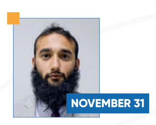
SALMAN AHMAD QAYOUMI